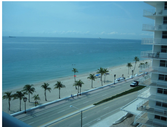
Every room with a water view and balcony!

Check out AHDI-FL's website at www.ahdi-fl.org for further information and registration!